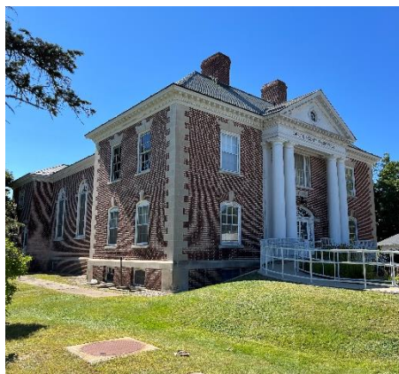
Carroll County Courthouse (R): An attempt to convert this former courthouse into a county-wide historical museum and research center failed and the deed was returned to the county. A new use is needed.