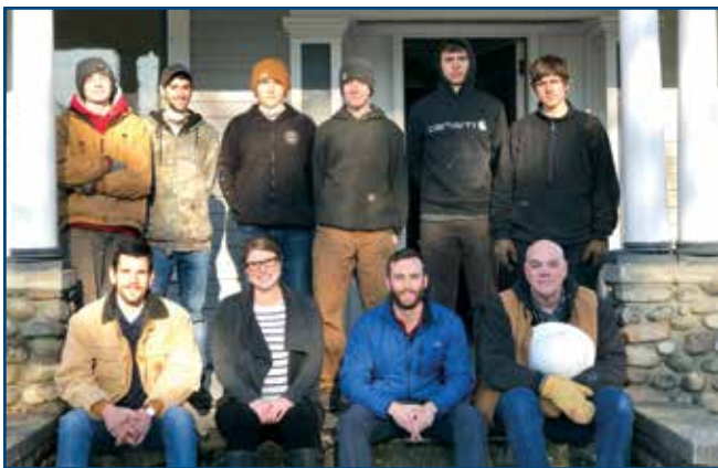
We are heartened to see the younger generation taking an active interest in preservation. Notable examples include a high-school trades program’s acquisition of the Judge Ripley House in downtown Colebrook (pictured here) so students can learn preservation and rehabilitation techniques, and a detailed proposal by Girl Scouts in Wolfeboro to convert a vacant municipal electric building into a much-needed community center.