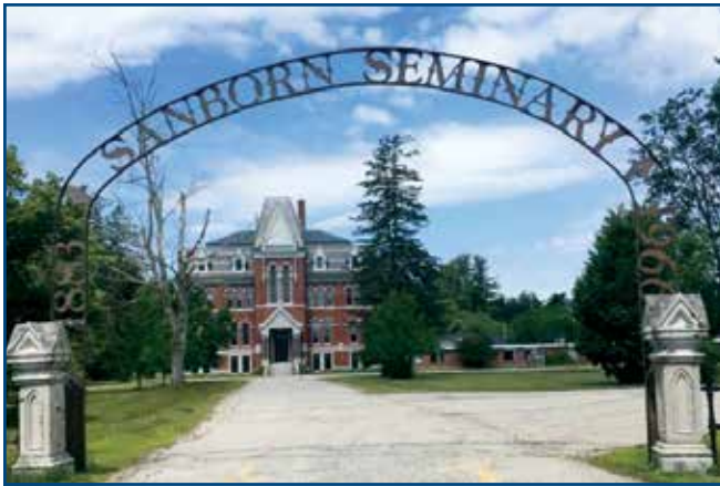
Kingston voted for the downtown tax incentive (RSA 79-E) this spring, in part to assist in the rehabilitation of the long-vacant Sanborn Seminary.