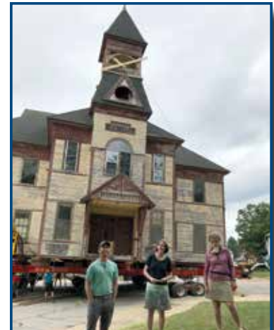
"Saves" this year of places like the Gale School, pictured here, remind us of the incredible tenacity of our local leaders and the importance our "value added" services.