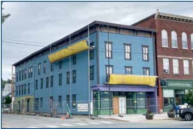
This Main Street anchor in Lancaster, the J.P. Noyes Building, has a rich social history – the sugar coated pill and other pharmaceutical inventions originated here. It is being rehabilitated and totally revived with a local food store on the first floor and market-rate housing above.