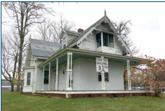
This 1840s West Chesterfield Greek Revival house in center of the village (Seven to Save, 2019) sat empty for years and now has a new buyer with town-approved plans for a cafe and short term stay rental.