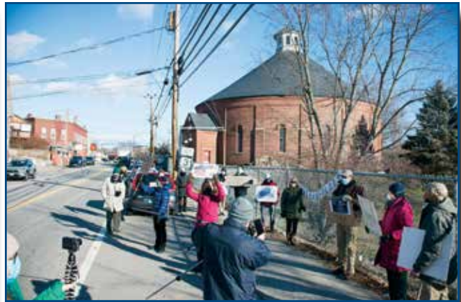
At this time last year, demo of the last-of-its kind 1888 Concord Gasholder seemed like a real possibility. Owner Liberty Utilities, the City of Concord and the Preservation Alliance, working together, identified funds pledged for emergency stabilization, attracting widespread public support and creating a sense of opportunity ahead.