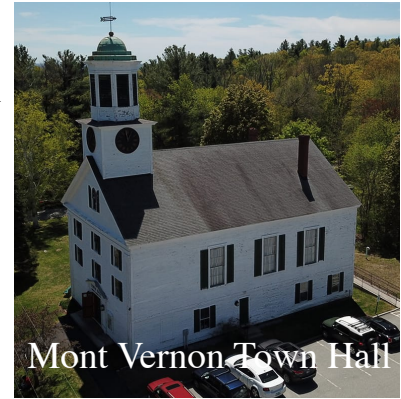
Mont Vernon Town Hall

Built in 1781 and expanded with a second story, this center of civic life and home to town offices and the local historical society needs a major investment to keep it viable for public use.