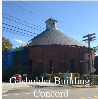
Gasholder Building, Concord

This graceful arch over the Winnepesaukee River, connecting Main Street to Tilton Island Park, is a rare example of a combination cast-iron and wrought-iron truss bridge and needs careful evaluation and preservation.