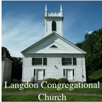
Langdon Congregational Church

Reviving this 1842 classic Greek and Gothic Revival building is the next critical step in maintaining the historic village center of this tiny rural community.