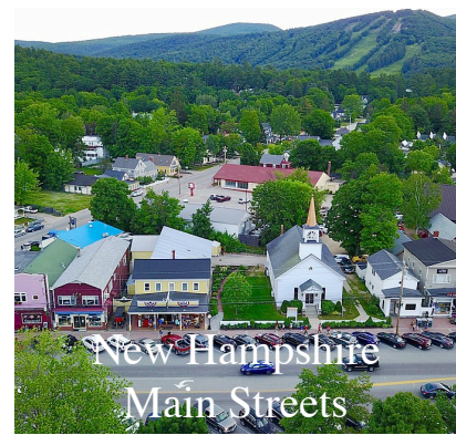
New Hampshire Main Streets

Main streets across the state, vital to our economic and social well-being, are vulnerable and essential. COVID's restrictions and changes have magnified the challenges they face — from theaters to sacred places to retail, dining and lodging establishments.