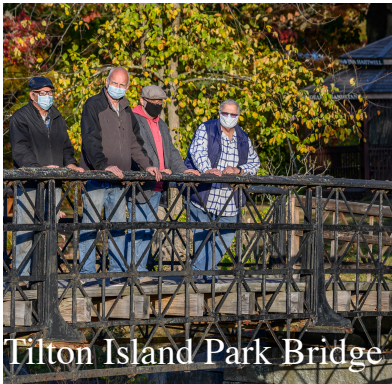
Tilton Island Park Bridge

This graceful arch over the Winnepesaukee River, connecting Main Street to Tilton Island Park, is a rare example of a combination cast-iron and wrought-iron truss bridge and needs careful evaluation and preservation.