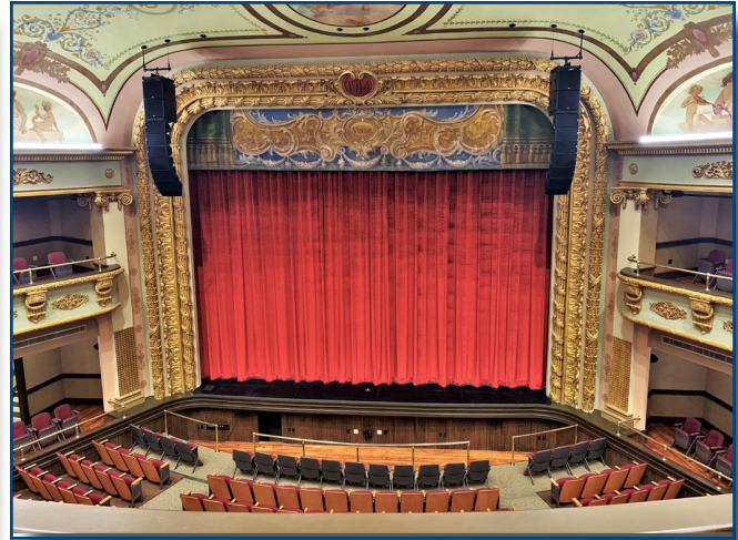
It was a big year for ribbon-cuttings and other celebrations for former Seven to Save properties like the Colonial Theatre, Laconia that we’ve helped in different ways over the years. We’ve been told that from workshops to emails to face-to-face visits the Preservation Alliance has been there with advice and suggestions.