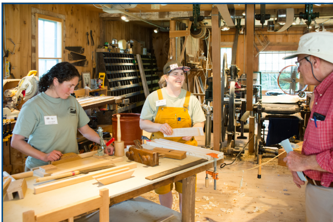
The Preservation Alliance received support from the National Trust for Historic Preservation to assess preservation trades education and recommend improvements to address the shortage of qualified professionals.