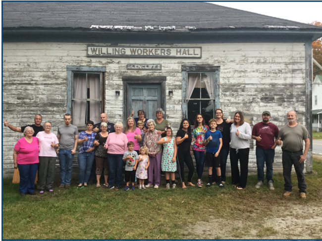
Our “bricks and mortar” grants, funded by individual donations and partnerships with The 1772 Foundation and the Northern Border Regional Commission, helped over 30 community groups and municipalities assess, repair and restore their historic buildings like the Willing Workers Hall in Warren.