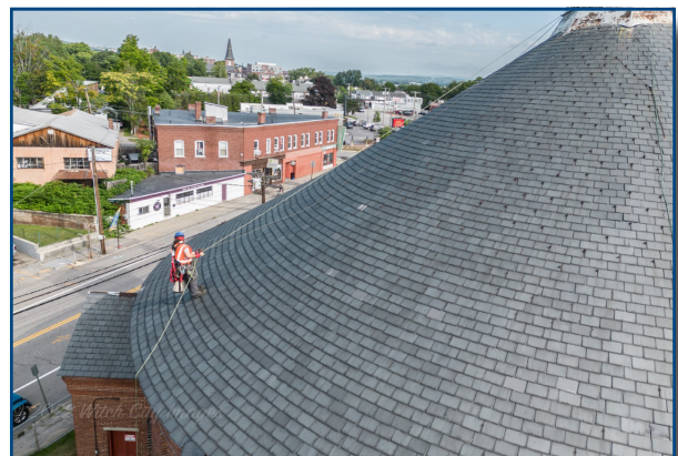
Demolition of the last-of-its-kind Gasholder in Concord was avoided, thanks to our efforts and negotiations with the owner, Liberty Utilities. Our continued leadership facilitated a much-needed stabilization project.