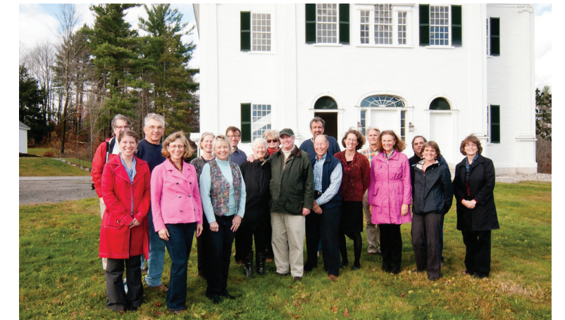
Board members, staff and friends toured the Actworth Meetinghouse, 2007 Seven to Save and national preservation honor award winner, in November.